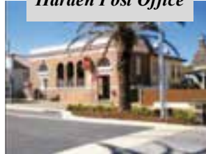
Harden Post Office