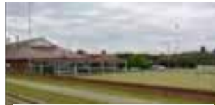
HARDEN BOWLING CLUB