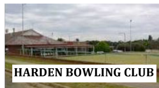
HARDEN BOWLING CLUB