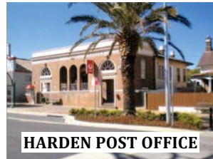
HARDEN POST OFFICE