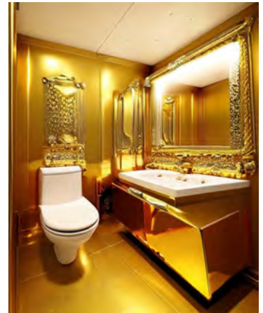
Artist's impression - released April 1st

I do hope that I can report in our next newsletter that we have our bathroom upgrade completed of which we are eagerly awaiting a start date.