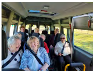
Boorowa trip, Sep 2023