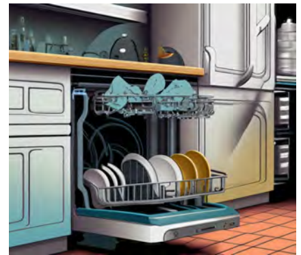
April 1st image of new dishwasher