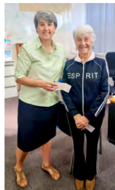
Harden Lady Bowlers