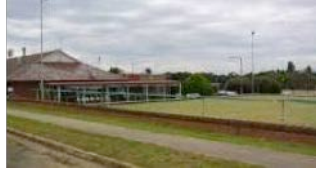
HARDEN BOWLING CLUB