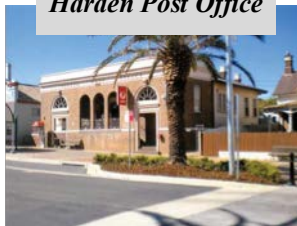
Harden Post Office