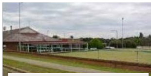
HARDEN BOWLING CLUB