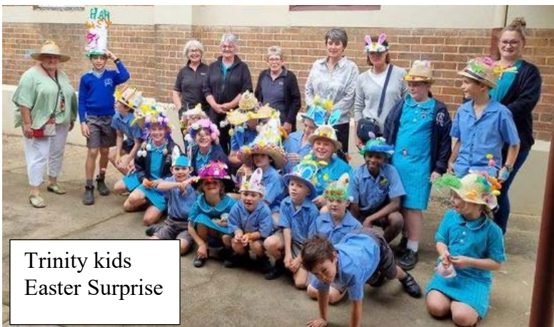
Trinity kids Easter Surprise