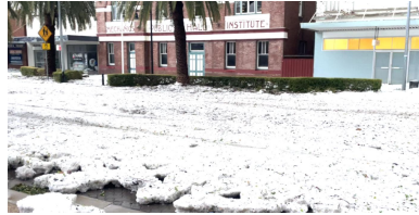
Neil st, 10th Feb.

Welcome to 2025 and things continue to be very busy at Flexi Care. In February we were challenged by the massive hailstorm that ravaged Harden leaving us in disrepair for the immediate days after the event. I thank all my team here for their diligence and patience in the working conditions that we have managed in the past 4 months.